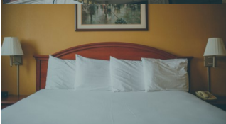
Hotel Ottumwa 107 E. Second Ottumwa, Iowa